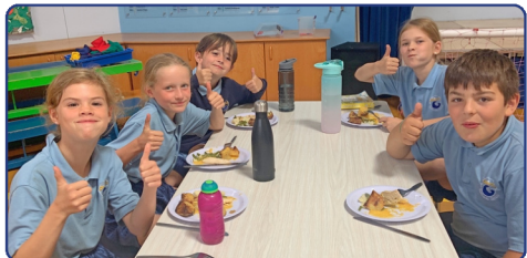
Pupils at St Luke's Primary School enjoying lunch