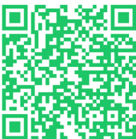
Jersey School Food Standards